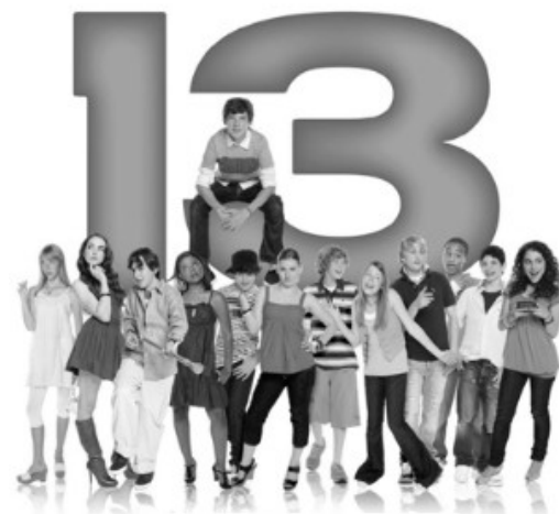
Above: The original Broadway advertisement for "13"