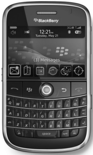
The BlackBerry Bold