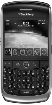
The BlackBerry Curve