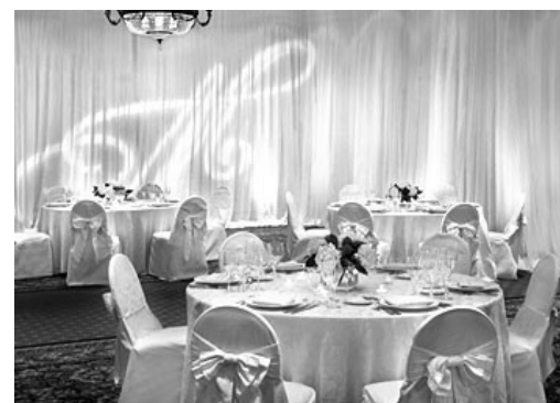
Above: A promotional picture of the Bridgewater Marriot's "Grand Ballroom", which will be decorated especially for our senior prom!