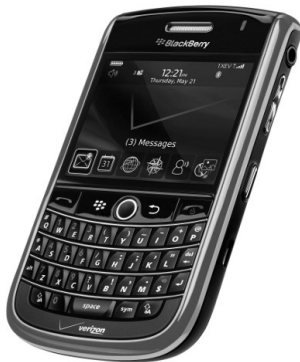
The BlackBerry Tour