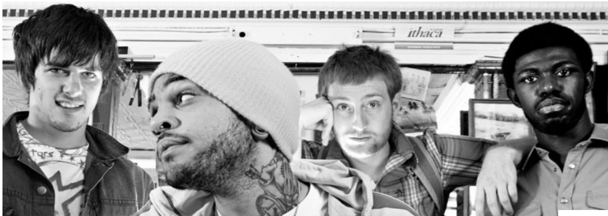
Left: One of this year's Warped Tour Headliners, Gym Class Heroes.

Two NJ shows are planned: Thursday, July 21st in the Susquehanna Bank Center, in Camden, NJ, and Monmouth Park Raceway in Oceanport, NJ on Sunday, July 24th! Get your tickets soon!