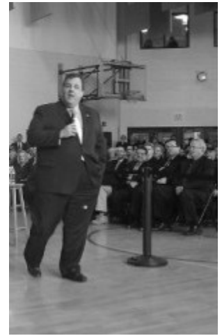
Above: Gov. Christie addresses the crowd at the Community Center.

About four-hundred-fifty people showed up to the town hall meeting and gave off mixed feelings to the governor. Some were heard calling Governor Christie "a liar" because he cut off particular services and continued to raise taxes. Many even wore t-shirts that had propaganda written on them against him, while others said after the meeting that he seemed to be "a nice man" and that they appreciate him. One Woodbridge resident stated, "He's not going to please everybody, but everybody has to give a little...he works with everybody and has an ear that listens". Some were