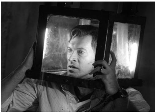
Left: A character from "Saw 5" finds himself stuck in one of "Jigsaw's" traps.

If you are not already a fan, the fifth movie is no different from the rest, so I would not recommend you see it. But if you have followed the series, the fifth movie answers some of the questions posed by the fourth, so I would suggest it. The traps in the fifth movie are not the best of the series and the best I can say is that this movie is "good"; it is better than the majority of "scary" movies Hollywood releases. "Saw 5" is really for people who have followed the series from the beginning and intend on following it all the way through.