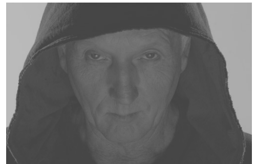
Right: Actor Tobin Bell portrays the mysterious "Jigsaw".