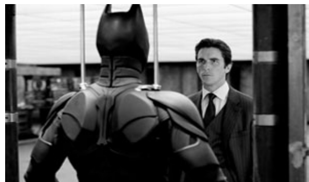
Above: Bruce Wayne (Christian Bale) examines the Batman armor.

This film has been in serious talks by critics about the film receiving Oscar nominations at the 81 st Annual Academy Awards which will be held on February 22, 2009. It broke a record and took the place of Spider-Man 3 for biggest first weekend gross ever. If you are a fan of the Batman series, or film in general, this is not a movie to miss!