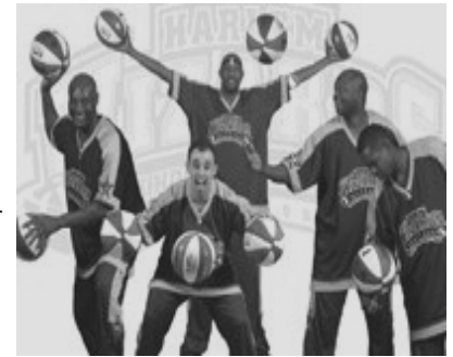
Above: Members of the Harlem Wizards pose for a publicity shot.

Congratulations and thank you to everyone involved in this fun and successful fundraiser!