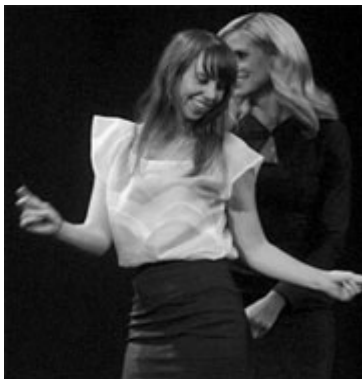
Left: Season 5 winner Leanne Marshall dances after hearing she won the top prize.

If you love fashion design, this is the perfect show for you. It is amazing to see these designers create a garment in just a short amount of time. I think everyone will be hooked after watching just one episode!