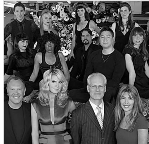
Right: The contestants, judges and hosts of "ProjectRunway" season 5