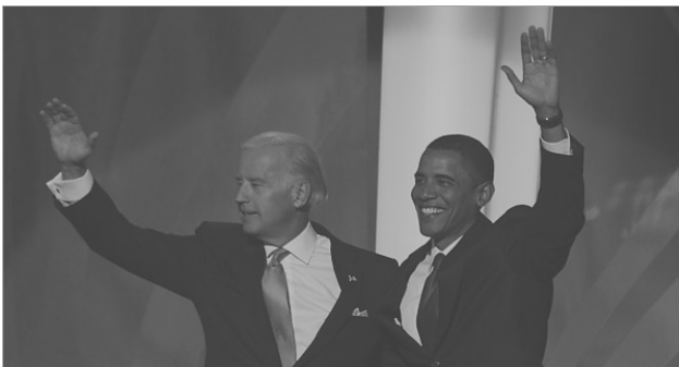
(left) Joe Biden and Barack Obama celebrate their victory.

"I'm asking you to believe. Not just in my ability to bring about real change in Washington ... I'm asking you to believe in yours." ~Barack Obama