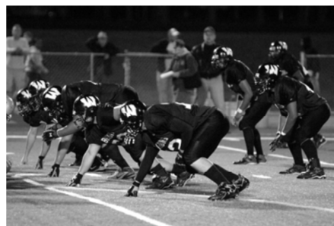
The Barrons defense lines up for a play against Sayreville.