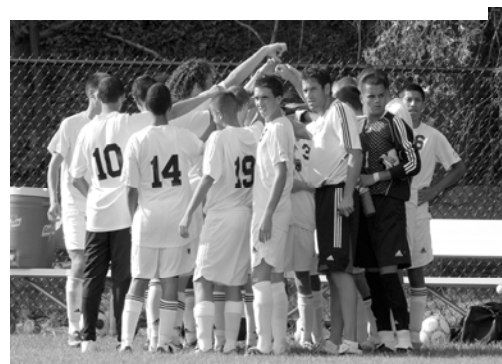
(Above) Barron's Varsity Boys prepare for a game.